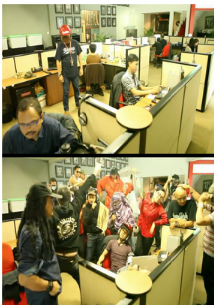
HARLEM SHAKE (Rolling Stone Indonesia Edition).webm cc by 3.0

Discover the story behind the Harlem Shake at https://hivi.uni.lu/2022/06/15/discover-a-meme-4-do-the-harlem-shake/